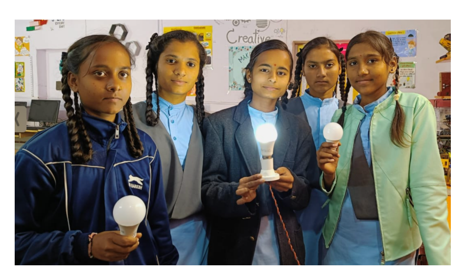
Story #3: InfoBridge Chatbot, Connecting Villages With a Click

In this newsletter, we continue our "25 Stories for Our 25th Year" series, spotlighting two extraordinary stories of women and girls in STEM fields in our own projects.