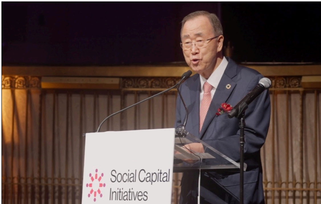
8th Secretary General of the UN, His Excellency Ban Ki-moon delivers the opening address at our Gala.