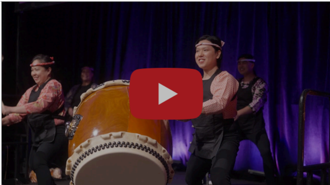
Catch the highlights from our 25th Anniversary Gala in our video recap!